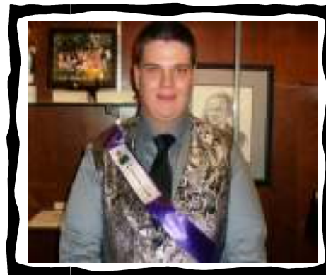
4-H HONOR CLUB